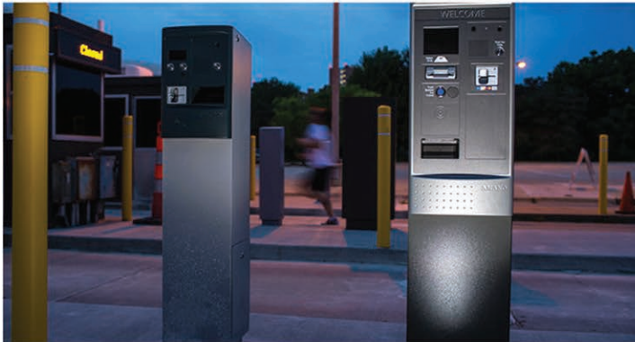
> Metro DI Staff - Jul 16, 2015